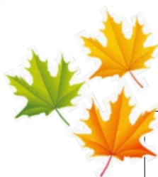
Table Top sale / Coffee Morning 4th Nov 10-12 in the Church Halls.